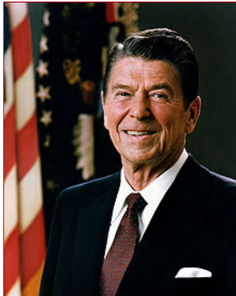
President Ronald Reagan - Official Portrait

Tomorrow, nearly 250,000 pages from the Reagan administration will be released for the first time.